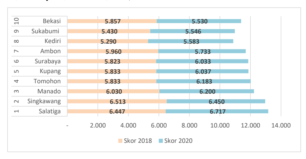
Figure 1. The score of the Most Tolerant City in Indonesia (Setara, 2018).

Ideally, all religions teach to respect followers of other faiths, work together in building a peaceful and sustainable life, be tolerant, and even build coexistence with each other (Pajarianto, Pribadi, & Sari, 2022), in a multireligious society (Pajarianto & Mahmud, 2019). Religion has a significant influence on society and the socialisation of citizens, both positively and can be damaging if misinterpreted. The ideal of religion was born outside of a human will because it is absolute. Unfortunately, religious intolerance and hatred continue to prevail around the world. How many churches have been burned and bombed, and synagogue congregations, churches and mosques worldwide have been victims of shootings, bombings and arson (Bennett, Gunn, van Beynen, & Morton, 2022).