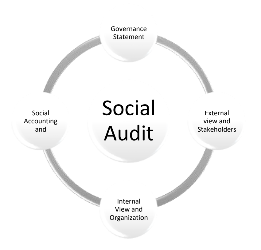
Figure 2. Social Aspects of Organizations

This model incorporates a social accounting framework, social audit reports and social accounting monitoring and recording. The audit continuously review the aims of organizational rules, operational objectives, policies, value base and set objectives. CSR should be measured by reference to and objective view of the stakeholders, external SWOT analysis rules and tasks, and an internal position analysis of set objectives. Companies use the social model toolkit for growth of local culture, helping to grow community welfare and strike a balance between profit goals and social goals.