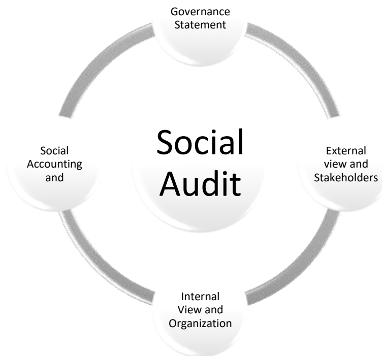
Figure 2. Social Aspects of Organizations

This model incorporates a social accounting framework, social audit reports and social accounting monitoring and recording. The audit continuously review the aims of organizational rules, operational objectives, policies, value base and set objectives. CSR should be measured by reference to and objective view of the stakeholders, external SWOT analysis rules and tasks, and an internal position analysis of set objectives. Companies use the social model toolkit for growth of local culture, helping to grow community welfare and strike a balance between profit goals and social goals.